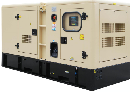
Optional Sound Attenuated enclosed unit shown