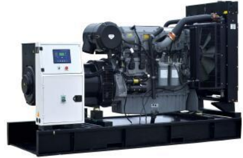
Open unit shown